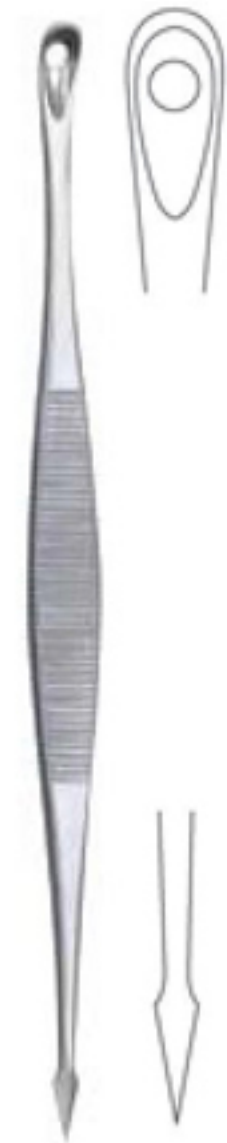
SAALFELD GD271.10 11 cm/4¼"