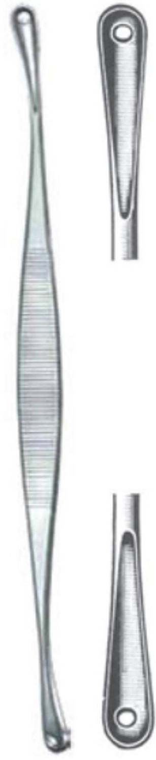
UNNA GD261.14 14.5 cm/5¾"