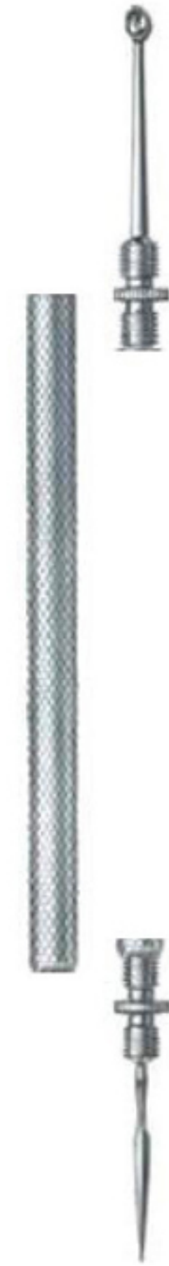
UNNA-VIDAL GD296.11 11 cm/4¼"