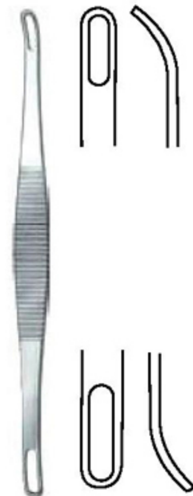
SCHAMBERG GD279.10 9.5 cm/3¾"