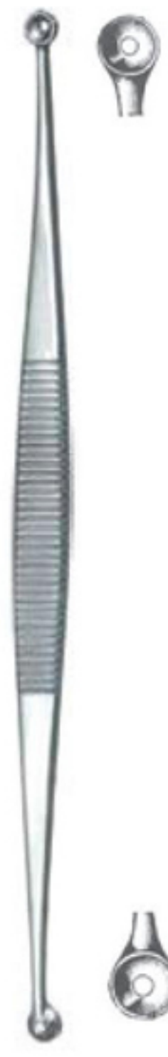
UNNA GD263.14 14 cm/5½"