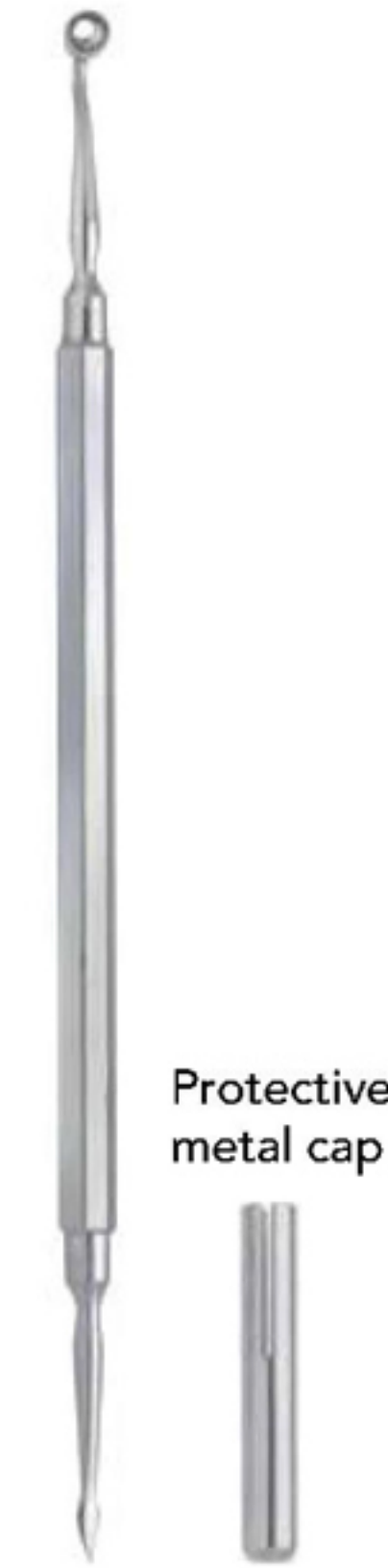
KATSCH GD294.14 16 cm/6¼"