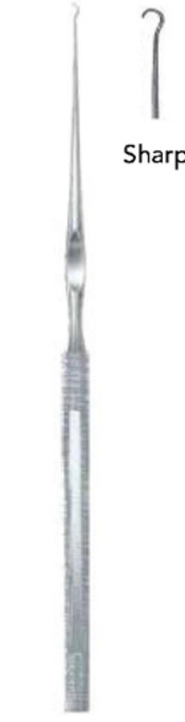
KILNER GD203.15 14.5 cm/5¾"