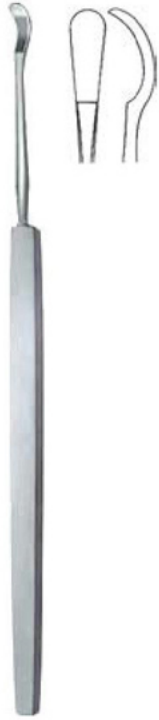
VIDAL GD135.14 13 cm/5¼"