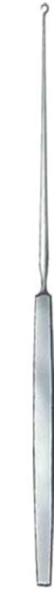
GILLES 18 cm/7"